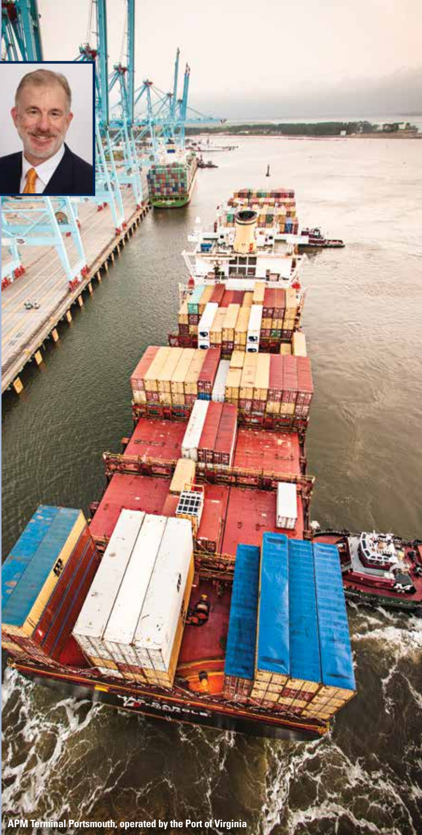
APM Terminal Portsmouth, operated by the Port of Virginia